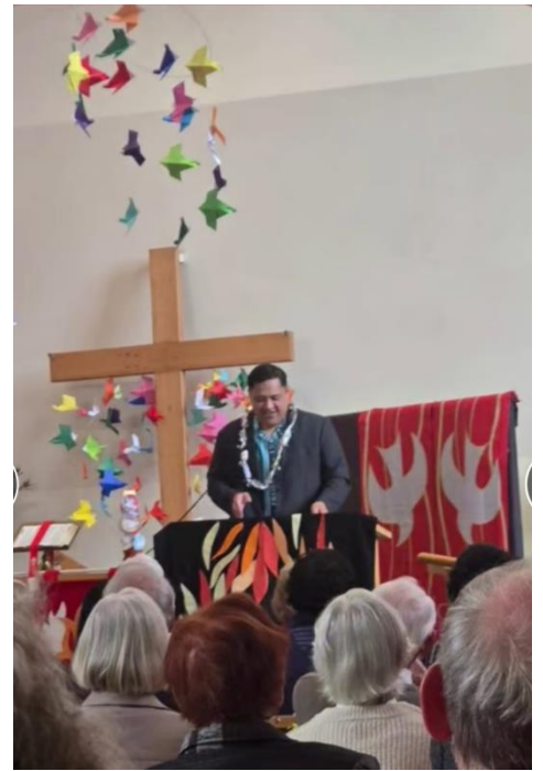
Combined Pentecost Service 24 May 2026