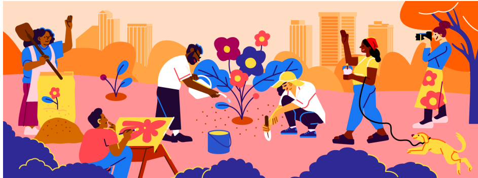
WHUC Community Garden.