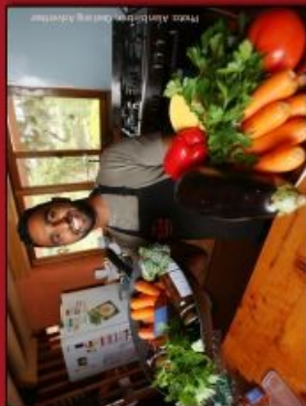
a social food project that is more than just a meal!