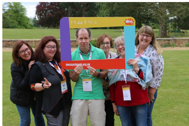
Plenty of Neat Lessons at Messy Church Conference article on Crosslight website https://crosslight.org.au/category/news/