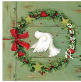
4 Peace Dove