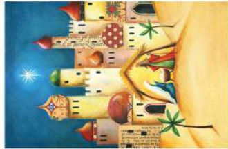
2 Mary & Joseph