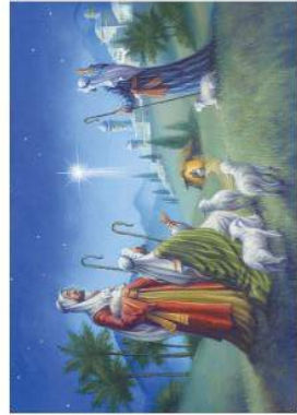
3 The Shepherds