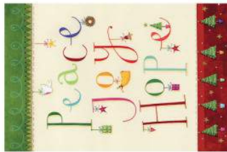
1 Peace, Joy, Hope