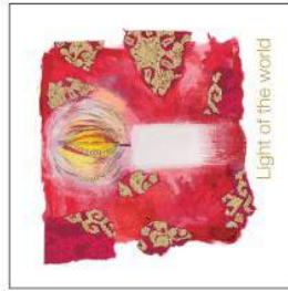
5 Light of the World